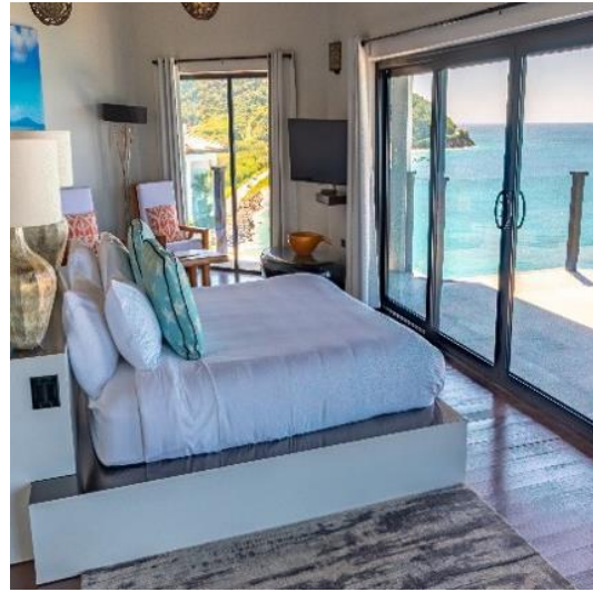
Ocean Front Villa - Master Bedroom