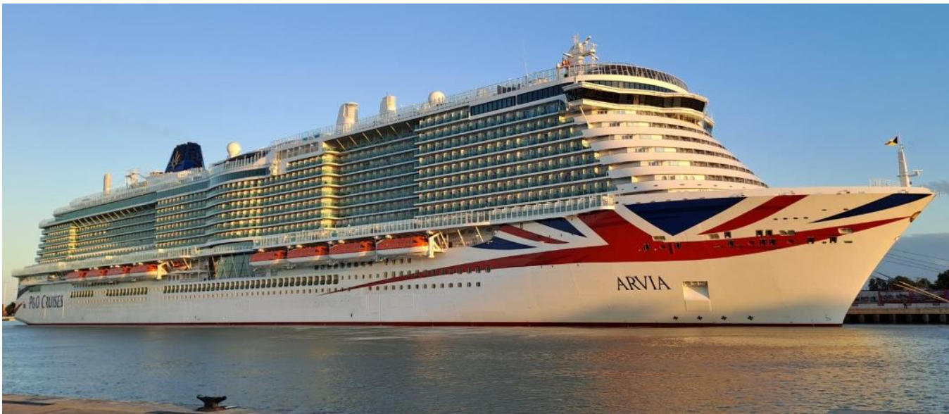
Arvia at Antigua Cruise Port's Fifth Berth