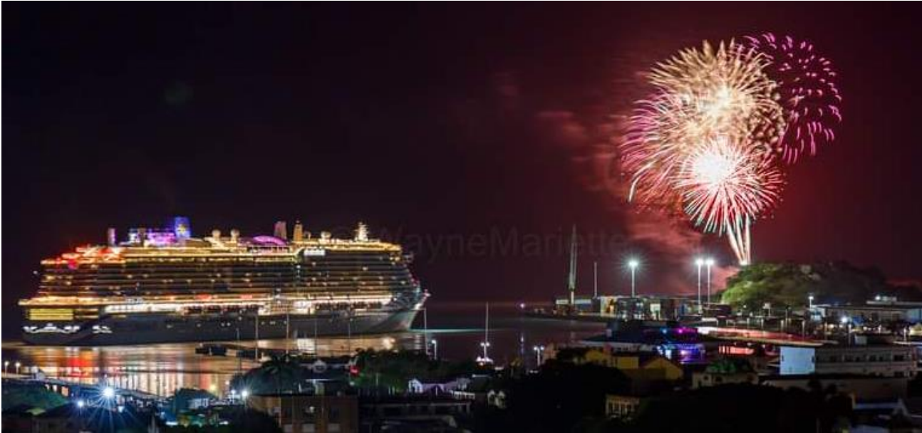
Arvia is given a grand farewell with a fireworks display