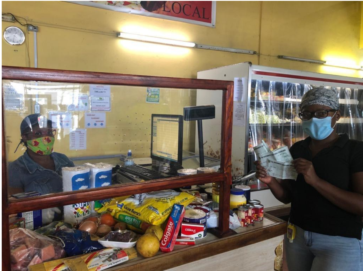
(Beneficiaries of the food voucher program have the option to redeem vouchers for goods at a variety of vendors in Antigua.)

lost their jobs and are unable to pay; by asking the banks to halt foreclosures for those who suddenly find themselves without an income to pay mortgages; by ordering APUA to forego disconnections until such time as its customers are able to pay—even small amounts. The social safety net was enlarged in order to ensure a humane response. Both Ministers who have held responsibility for Social Transformation, in the year 2020, are to be congratulated for their energy and their management of this crisis.