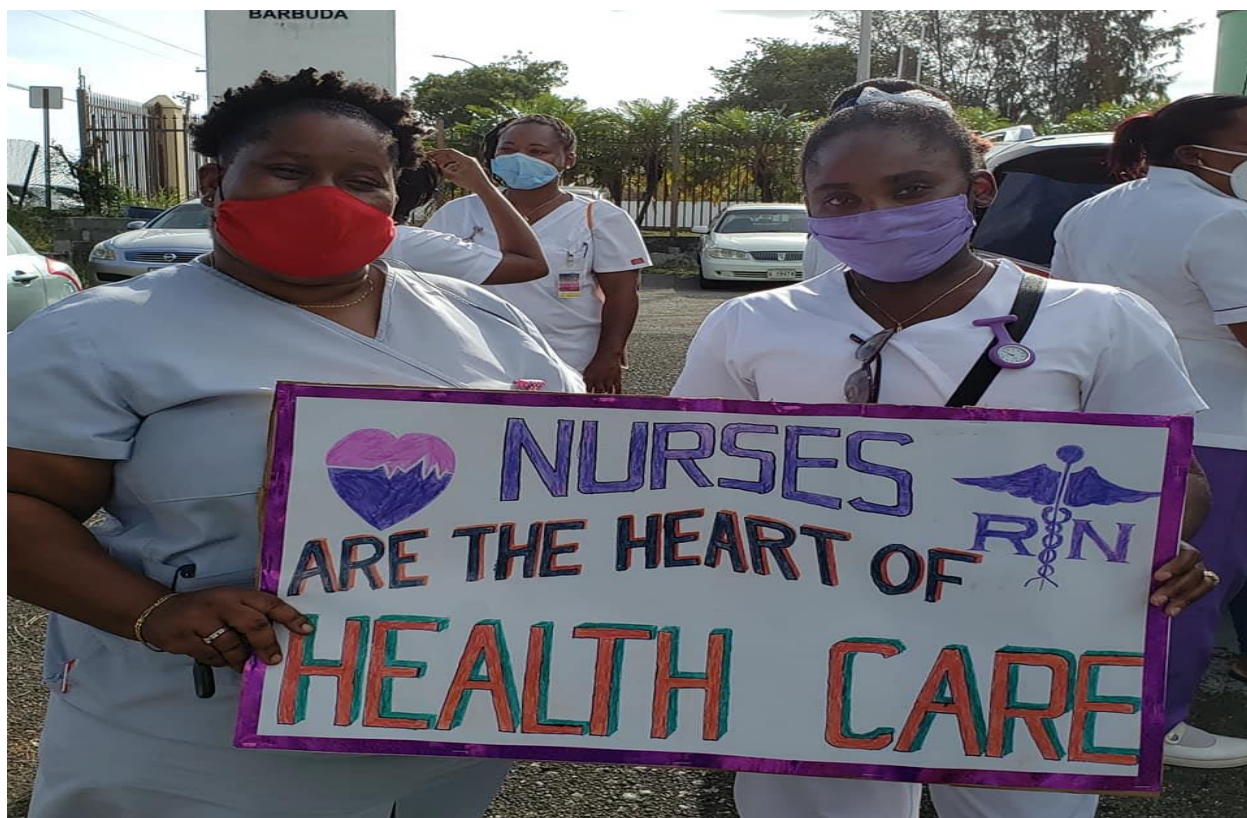
(Highlight from International Nurses Day Celebration 2020.)

The nation conferred national honors on a representative group of front-line workers during Independence celebrations 2020, and upon our nation's Minister of Health for superb leadership. Congratulations once more, Minister!