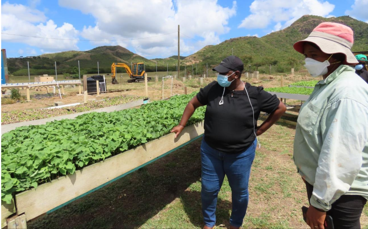
(A number of farmers received a variety of agricultural supplies such as fertilizers, seeds, drip irrigation lines and other inputs which assisted them in their production.)

My Government is pleased to report that agricultural output is beginning to rise, such that Antigua and Barbuda is self-sufficient in egg-production. More than $100 million dollars are still spent annually on importing different meats.