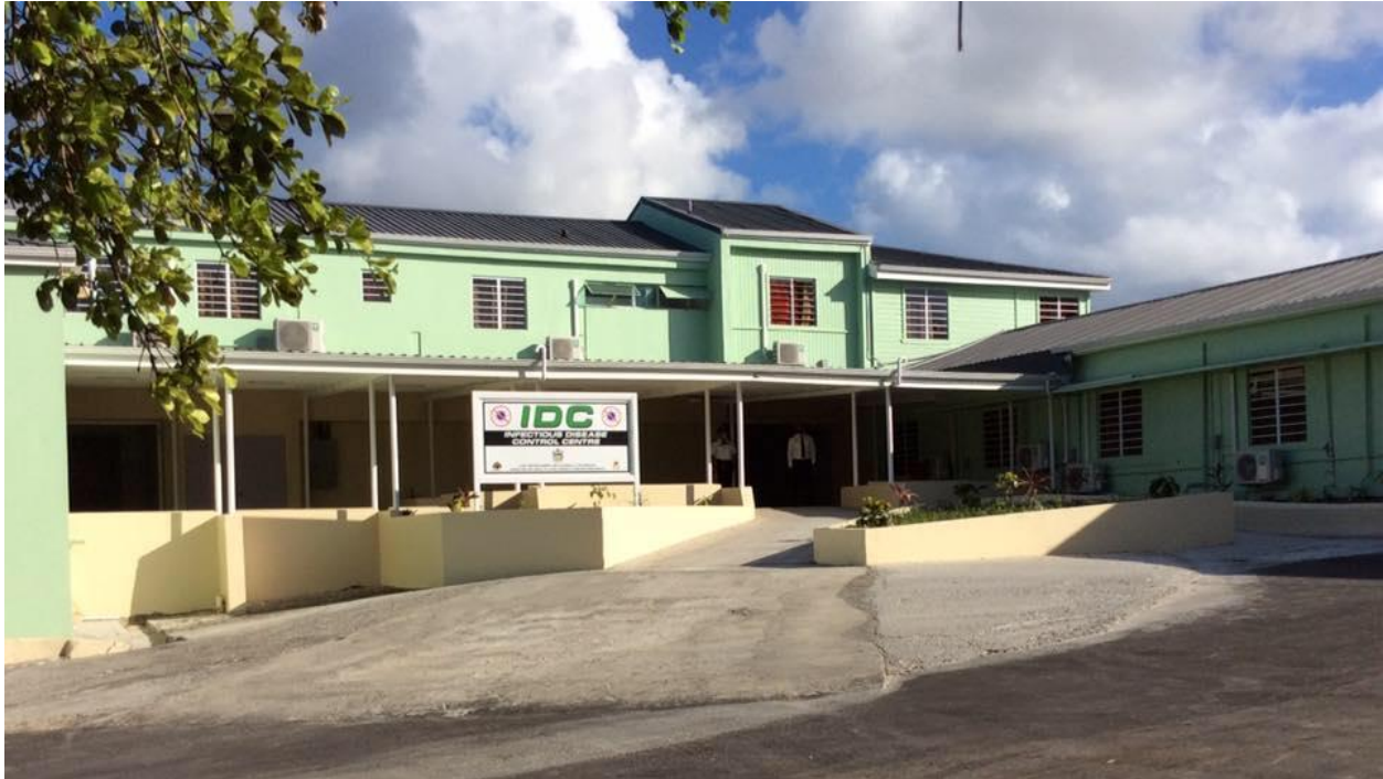
(The IDC is equipped with 17 isolation rooms and 18 sleeping quarters for medics)

staff are assured that its many challenges are to be fully addressed.