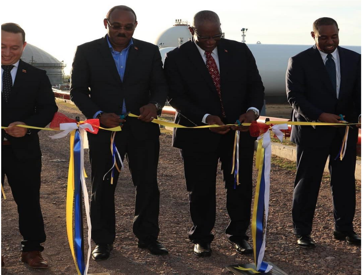
(2019 images from the Ribbon Cutting Ceremony of The Liquefied Petroleum Gas (LPG) Tank Facility.)