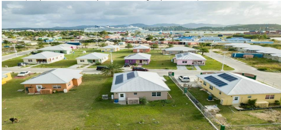
(Completed homes built by National Housing, Bay Street Villa.)

19. In Barbuda, 20 new homes have been delivered by my Government to needy Barbudan families, free of cost; they lost their homes in Hurricane Irma. And, scores of homes and the Hanna Thomas Hospital have been refurbished in Codrington with the partial assistance of international partners. The European Union plans to hand over 80 more homes to the Government of Antigua and Barbuda for the benefit of more of Barbuda's needy families. The People's Republic of China will