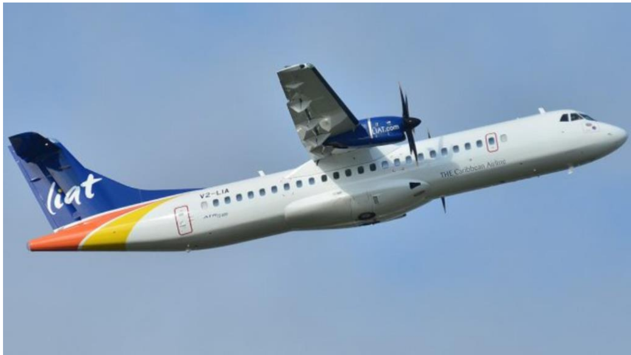
(LIAT reemerges in the skies. Nov. 1 st 2020.)

7. My Government is absolutely determined to ensure that LIAT survives the Covid-19 Pandemic. LIAT will also overcome the additional challenges which it faced before Covid, and Antigua and Barbuda will make sure that LIAT returns permanently to the skies, and that its headquarters remain here. These are fitting ambitions. The regional airline that—for more than six decades—has provided the connectivity which the Eastern Caribbean countries require, cannot be allowed to die. LIAT is a CARICOM institution; it requires the support of all countries it serves, utilizing a minimum-revenue-guarantee scheme similar to that from which several non-regional carriers benefit. LIAT will be reorganized and made profitable!