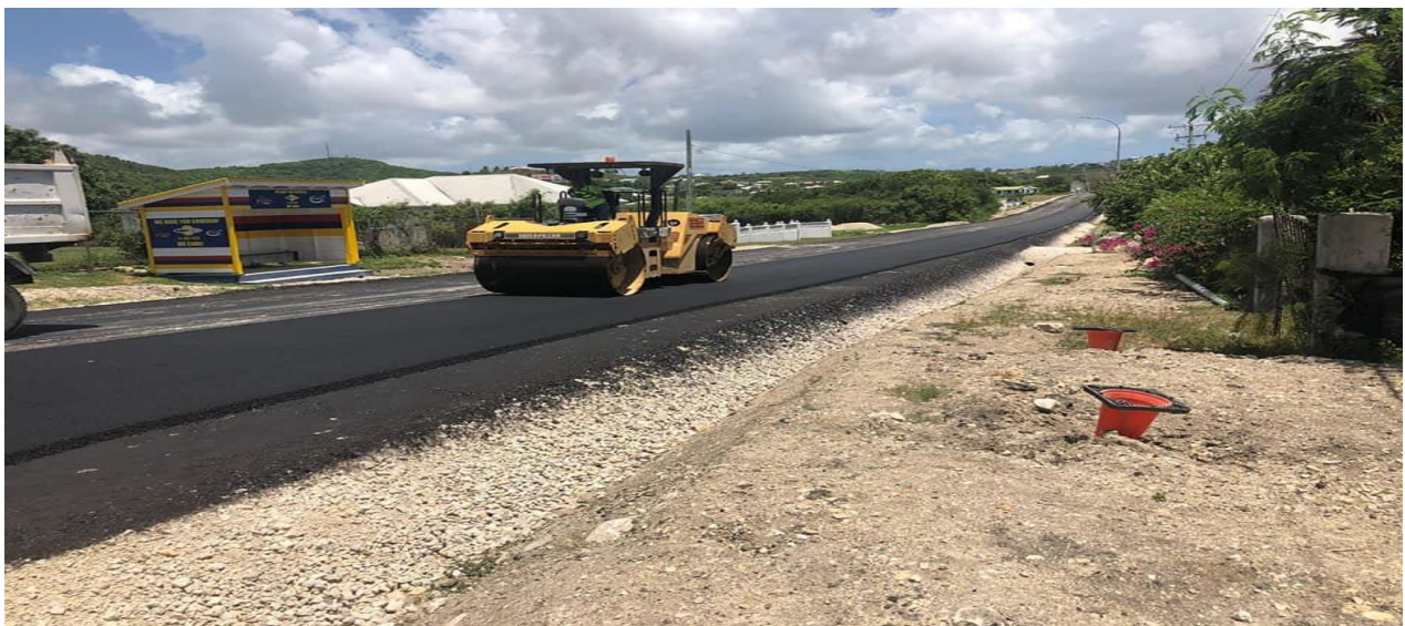
(Work on Friars Hill Road.)

My Government's road rehabilitation program, supervised by the re-branded Public Works, is no longer in a temporary holding pattern because of the Covid-19 pandemic; the work has already started. The dynamic Minister of Works promised performance and he delivered.