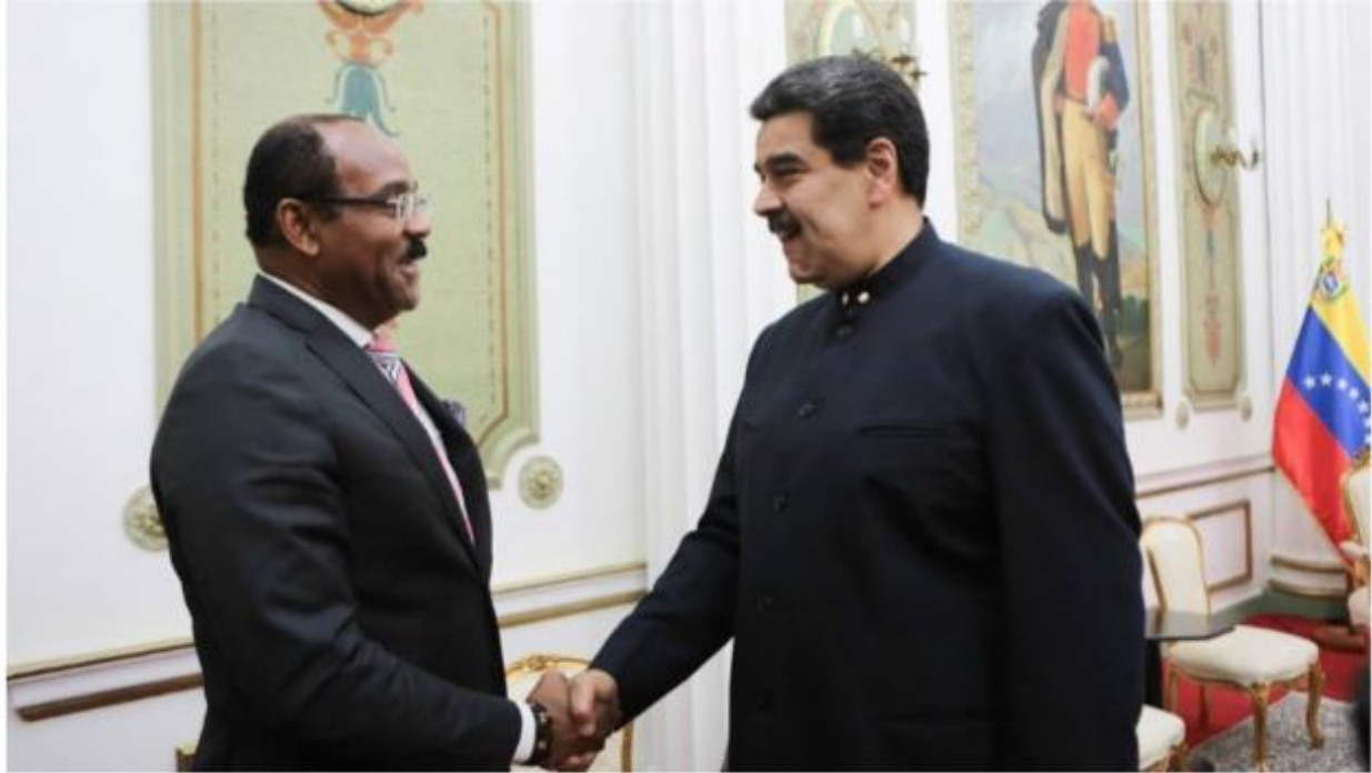
(Prime Minister Gaston Browne meets with President of Venezuela, Nicolas Maduro Moros.)

iv. The Republic of Cuba , constrained by an embargo that dates back to 1962 which has been intensified over these past four years—and which has wrongfully, just days ago, been declared a state-sponsor of terrorism—was the first to respond to my Government when the global Covid-19 pandemic threatened to consume this nation’s human resources. A brigade of Cuban doctors and nurses, dispatched from Havana, has contributed immensely to mitigating the human-resource challenges spawned by the dreadful Coronavirus disease. My Government congratulates the Henry Reeves Brigade for its nomination for the highly-regarded Nobel Peace Prize 2021. This brave nation of Caribbean people has also opened its universities’ doors, allowing hundreds of youthful Antiguan and Barbudans to acquire professional training over the years, many choosing to become doctors, veterinarians, engineers, architects, computer scientists—achievements by very bright youth which may otherwise have been unattainable. Thank you Cuba!