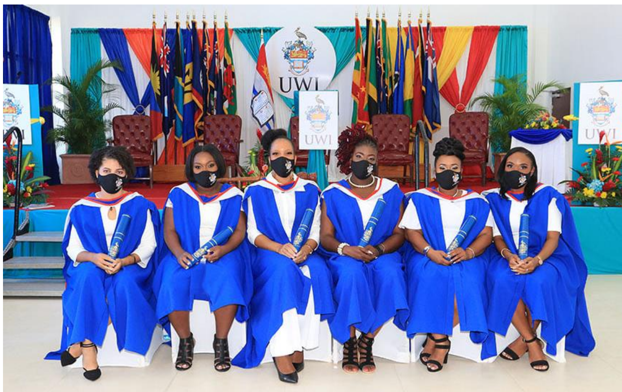
(Six women make history as first graduands of The UWI Five Islands Campus.)

The Antigua and Barbuda Hospitality Training Institute is another of those institutions that prepares a cadre of post-secondary students for leadership in the most important tourism sector. The UWI Open Campus was another. Building on these foundations, the Fourth Landed Campus at Five Islands is a continuum in this ambition to be prepared for an unknowable future. The former Minister of Education Science and Technology did an awesome job preparing our youth. He is to be applauded.