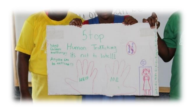
Bendals Primary School