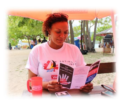
Antigua & Barbuda Sailing Week 2018 - Layday