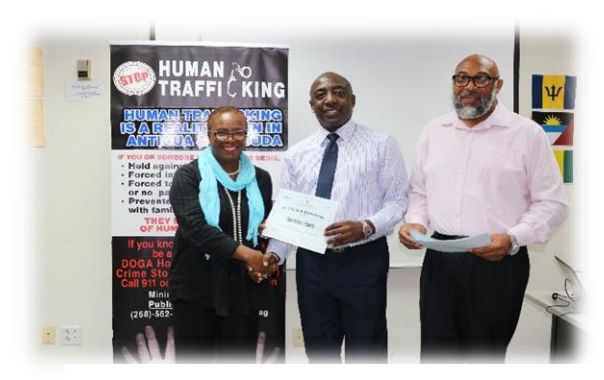
Leeward Island Air Transport (LIAT) Human Trafficking Training