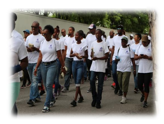
Annual Awareness Walk 2018