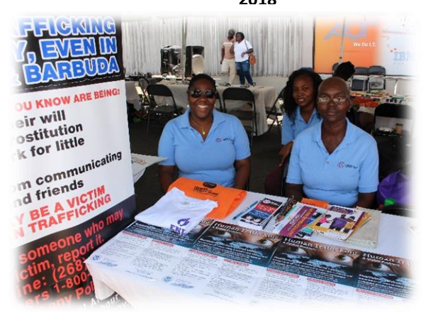
Family & Social Services Division Street Fair 2018