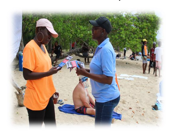
Antigua & Barbuda Sailing Week 2018 - Layday