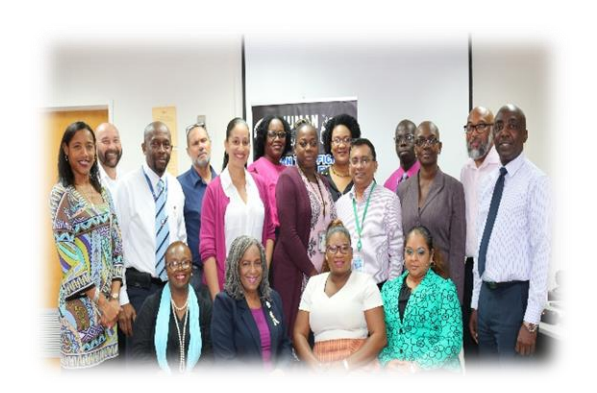
Leeward Island Air Transport (LIAT) Heads of Department Training