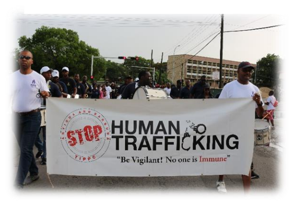
Annual Awareness Walk 2018