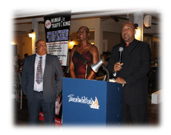
Annual Report Launch 2018