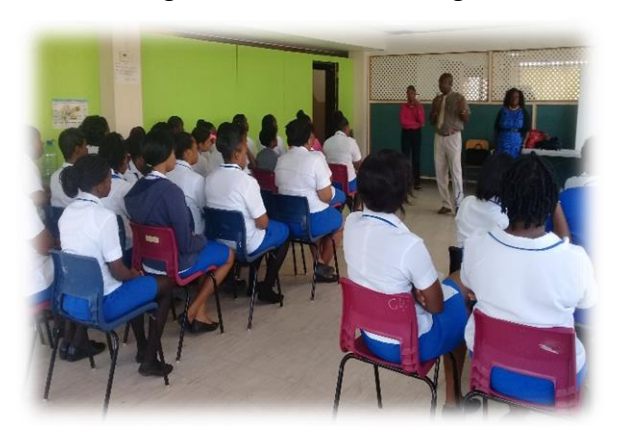
Antigua & Barbuda School of Nursing